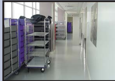
Clean corridor for re-supply of sterile equipment.

Each of the four ORs is identical and configured to accommodate all types of current surgeries.