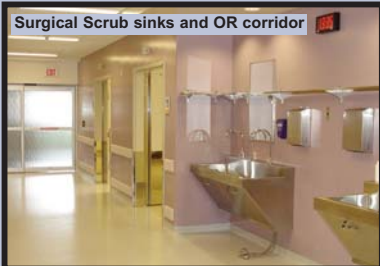
Surgical Scrub sinks and OR corridor

Patient bays easily accessible and monitored via an open concept nursing station.