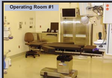
Operating Room #1

Each of the four ORs is identical and configured to accommodate all types of current surgeries.