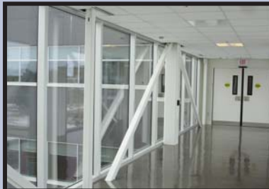
Secure link to new Surgical Suites from Surgical Unit on the third floor of Tower A.