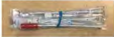
Amies Swab Collection Kit + single E Swab Kit